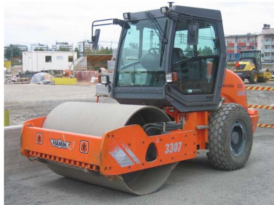
Smooth drum compactor for gravel and sand