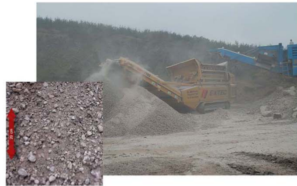
Mineral mixture being made from demolition concrete

Base courses without binders (Bw/oB) -Requirements-