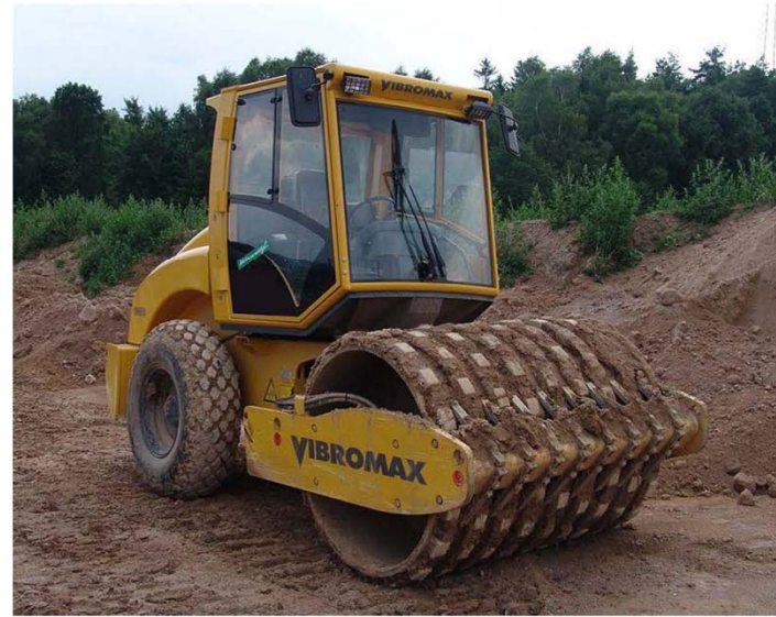
Sheepfoot roller for fine-grained surface materials